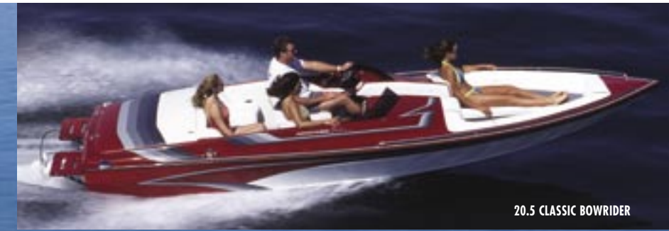
20.5 CLASSIC BOWRIDER