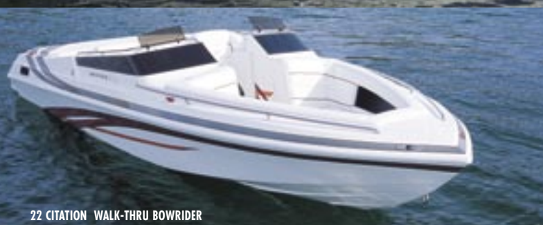
22 CITATION WALK-THRU BOWRIDER